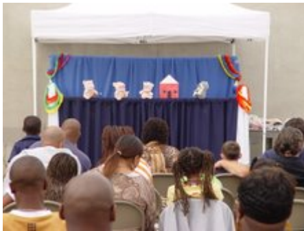
3 Little Pigs