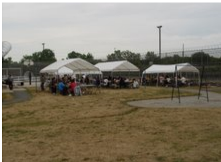
Fathers Day Picnic